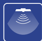
AVer Audio Fence