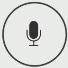
4 MIC ARRAY