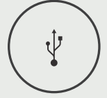
USB PLUG & PLAY